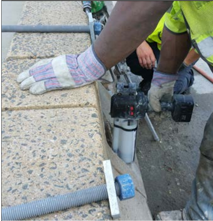
Remove and reset permanent precast concrete traffic barrier