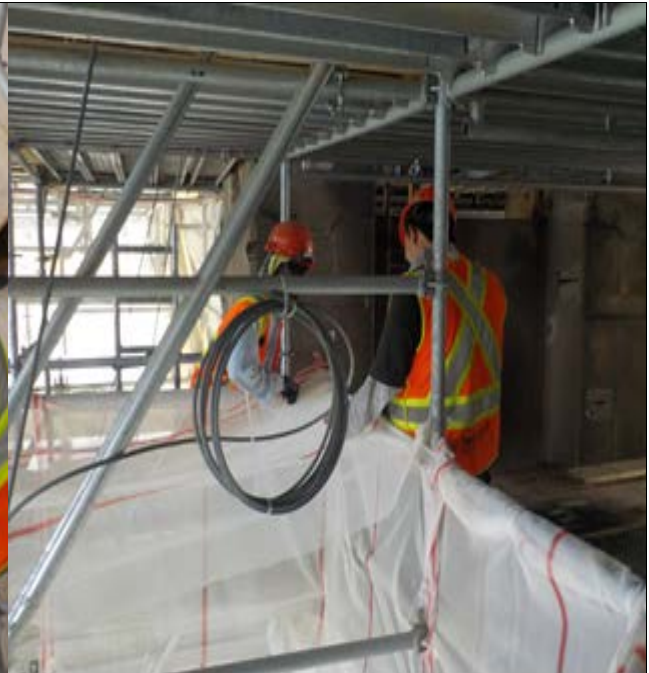
Installation of protection shield at pier 4