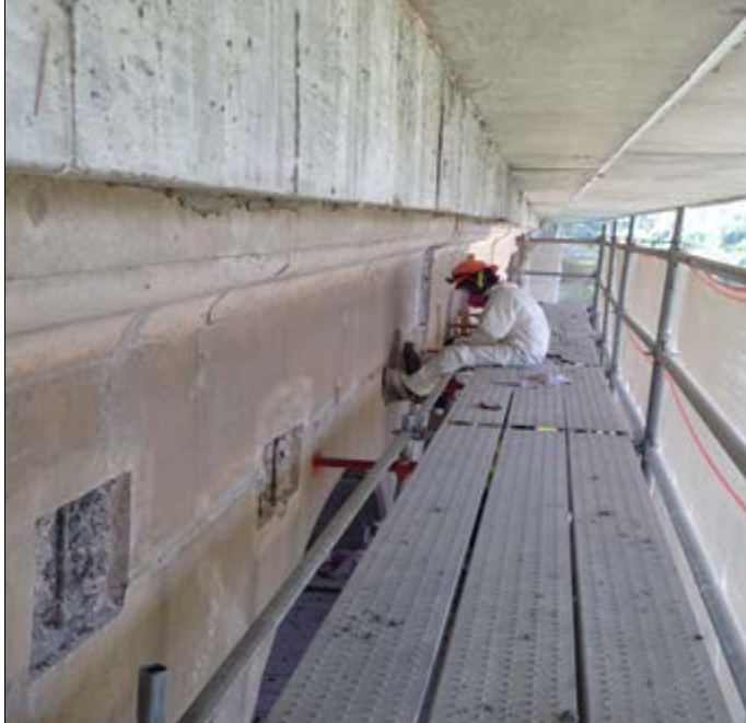
Chipping and sawcutting for concrete repairs