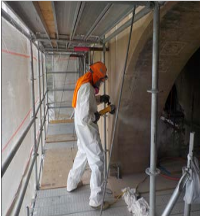
Chipping and sawcutting for concrete repairs