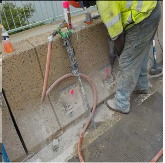
Remove and reset permanent precast concrete traffic barrier