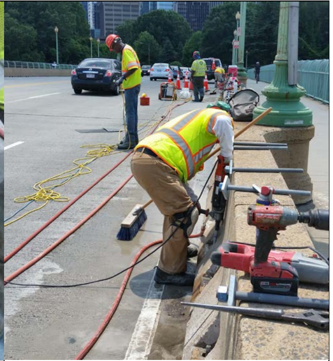
Remove and reset permanent precast concrete traffic barrier