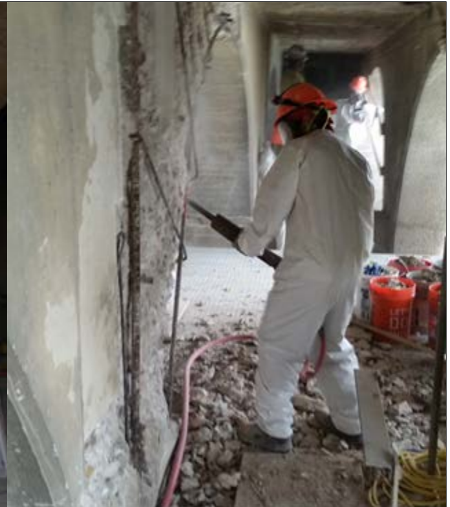
Chipping and sawcutting for concrete repairs