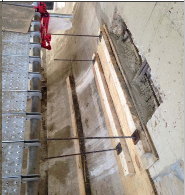
Pouring concrete for form and pour color mockups