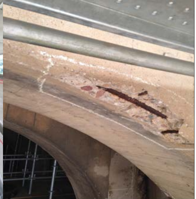
Sounding and marking locations for concrete repair