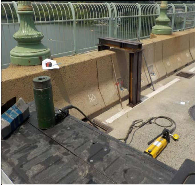
Pull-out test for concrete barrier anchors