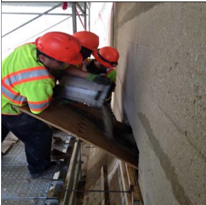
Pouring concrete for form and pour color mockups